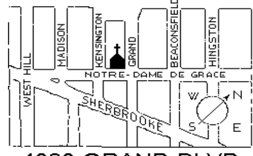
4020 GRAND BLVD. at Notre-Dame de Grace N.D.G.